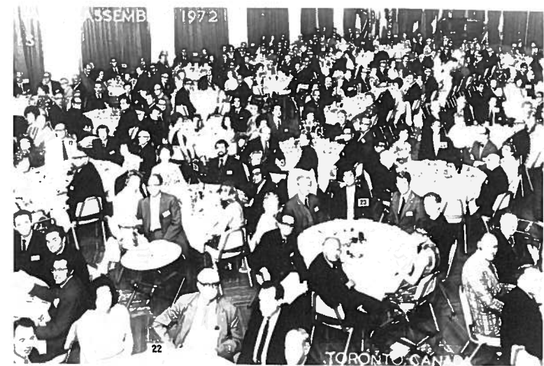
The 25th Annual Assembly at Toronto in 1972.