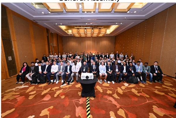
Young Professional Event