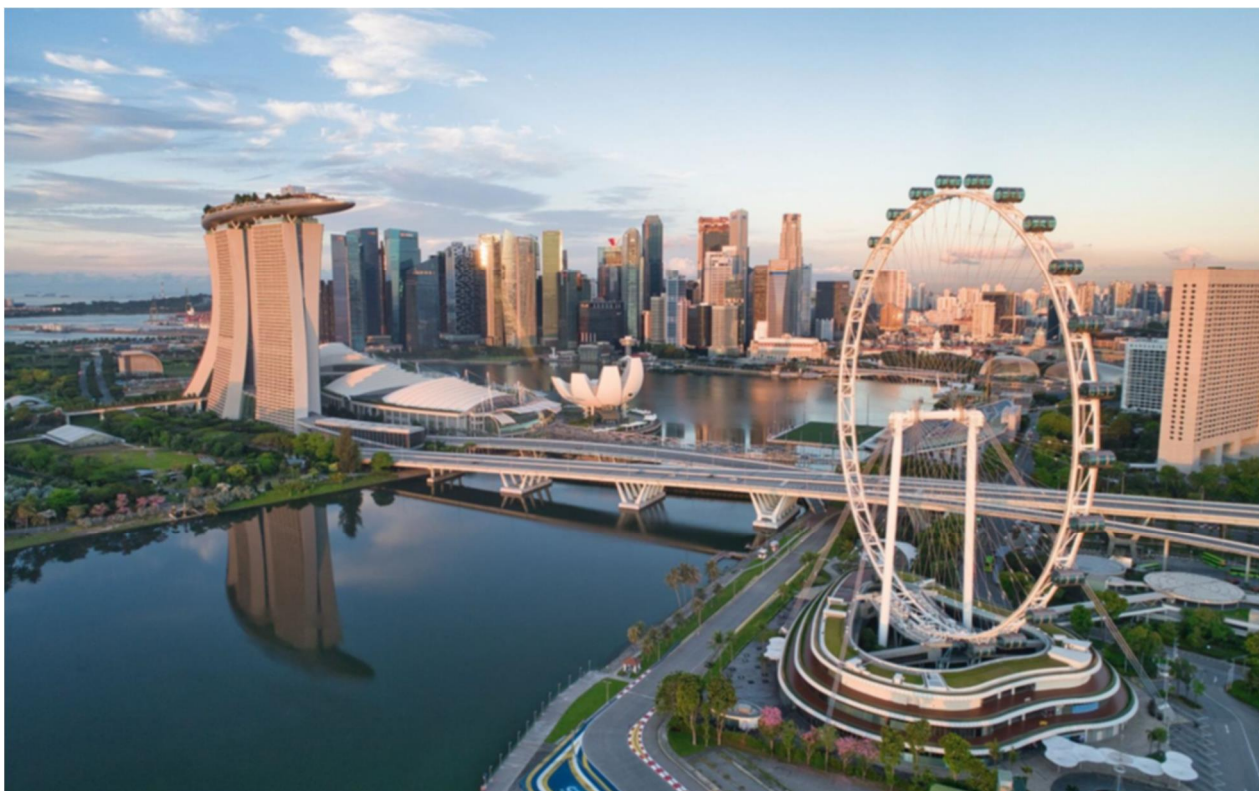
The 76 th IIW Annual Assembly and International Conference on Welding and Joining in Singapore, Marina Bay Sands Hotel and Convention Center.