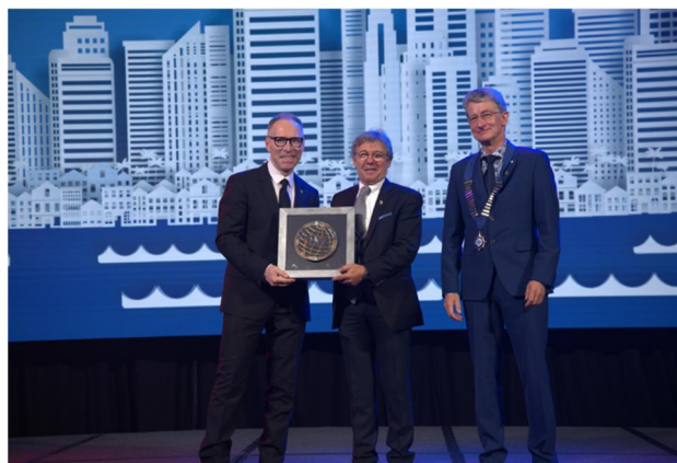
Hand-over of the IIW Presidency