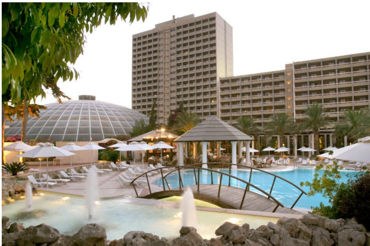
The 77th Annual Assembly of the IIW and the International Welding and Joining Conference will take place at the Rhodos Palace Hotel, Rhodes, GREECE, July 7-12, 2024.

IIW is looking forward to gathering the welding, joining and associated processes community together at upcoming Regional and International Congresses and associated events held in cooperation with its partners, and in particular, the 77th IIW Annual Assembly and International Conference on Welding and Joining which will take place from 7 th to 12 th July 2024 at Rhodos Palace Hotel (Rhodos, GREECE), Europe's leading destination for business, leisure and entertainment.