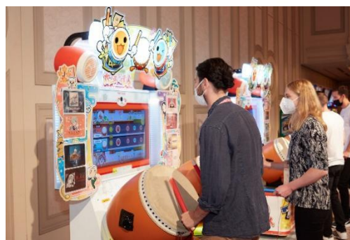
Young Professional Evening

At the end of the event, IIW is proud to announce that the 75 th Annual Assembly and International Conference has been a great success with great participation globally, and significant and prolific technical output: